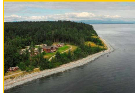
Aerial View Oceanfront

Wedding Package details are always subject to change