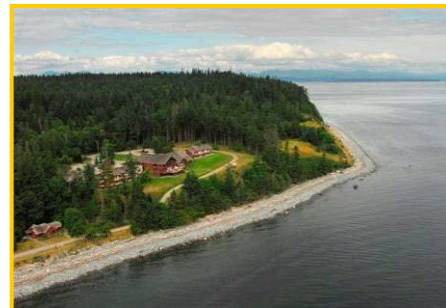
Aerial View Oceanfront