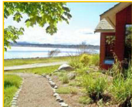
View from Cottages